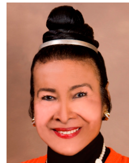
Keynote Speaker: Ms. Xernona Clayton

Tuesday, May 10, 2011 AT&T Midtown Two Auditorium 725 West Peachtree Street Atlanta, GA 30375 Silent Auction 6-7pm Reception 7-9pm