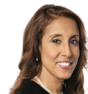
2010 Judge Penny Brown Reynolds

I would like to support Students Without Mothers by providing the following donation: